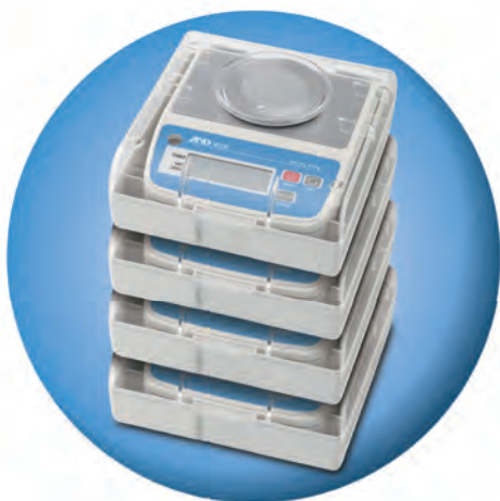
Stackable Carrying Case (Standard)